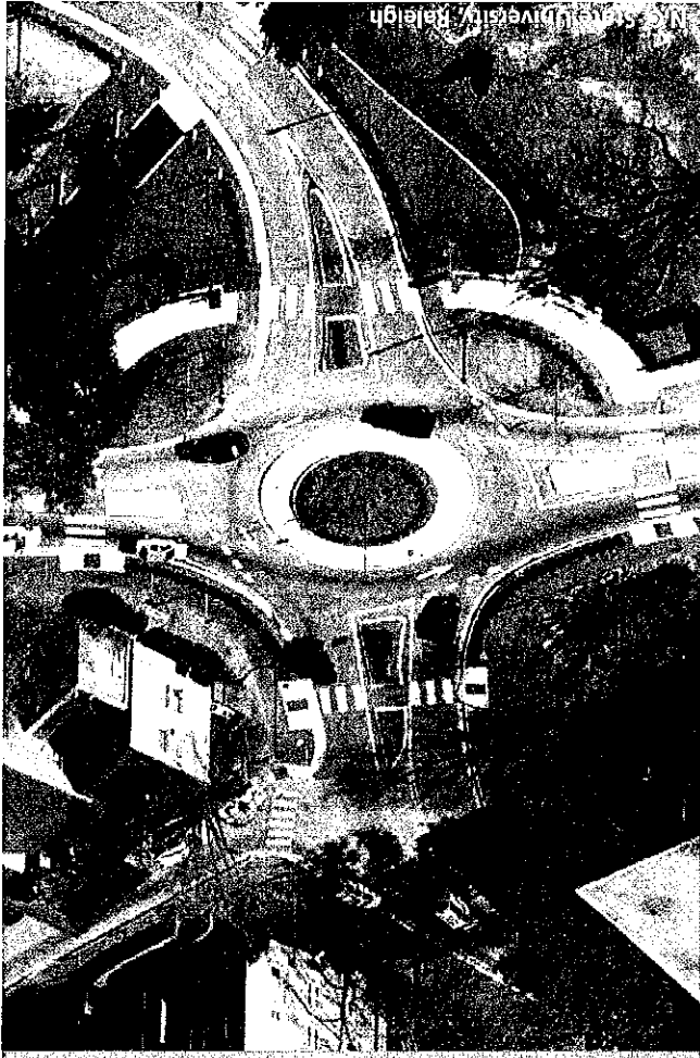
NTCS Roundabout, Raleigh