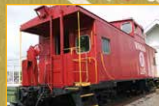
Caboose at the Matthews Train Depot

11 195 N. Trade St. Temple Mojo Growler Shop Beer Garden the former Matthews Post Office was built in 1939 for use as a post office. Its neoclassical revival style makes this building stand out on Trade Street. It served as the post office until 1962. Over the years, it has been the home of various retail businesses.