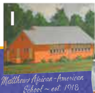
Matthews African-American School - est. 1918

l. In 1925 the Rosenwald African-American School opened in Tank Town, now Crestdale, serving local students. It closed in 1966 with integration and the building burned in 1975. Crestdale dates to the 1860s and is one of North Carolina's oldest African-American communities.