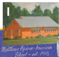
Matthews African-American School - est. 1918

l. In 1925 the Rosenwald African-American School opened in Tank Town, now Crestdale, serving local students. It closed in 1966 with integration and the building burned in 1975. Crestdale dates to the 1860s and is one of North Carolina's oldest African-American communities.