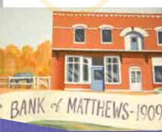
BANK of MATTHEWS-1909