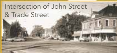
Intersection of John Street & Trade Street