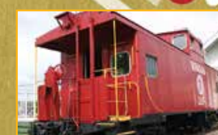
Caboose at the Matthews Train Depot